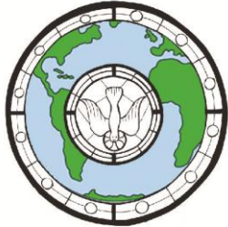
St. Matthew Peace & Justice Ministry