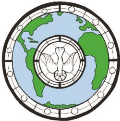
St. Matthew Peace & Justice Ministry

Mission Statement: The Peace and Justice Ministry of St. Matthew Catholic Church strives to shine a light on injustices as well as to educate and to engage our parishioners and our community on ways to achieve justice for every human person.