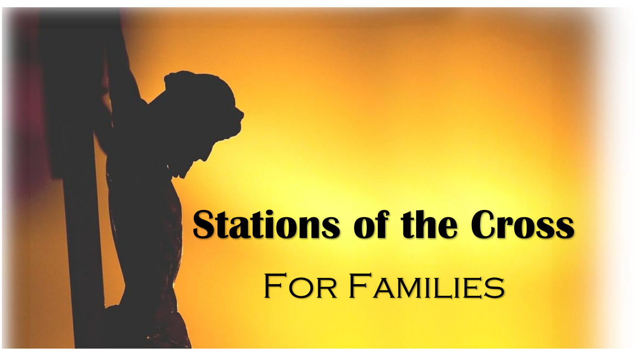
From family-prayer.org (edited & formatted for use at St. Mary Catholic Church – Mt. Angel)

Leader: + In the name of the Father, and the Son, and the Holy Spirit.